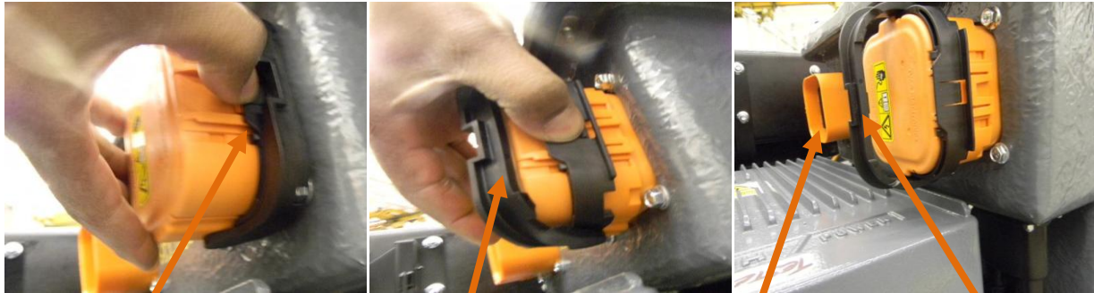
Push small black tab down