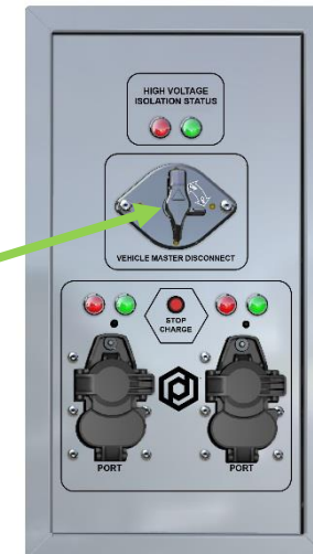
12/24-Volt Vehicle Master Disconnect (shown in OFF position)