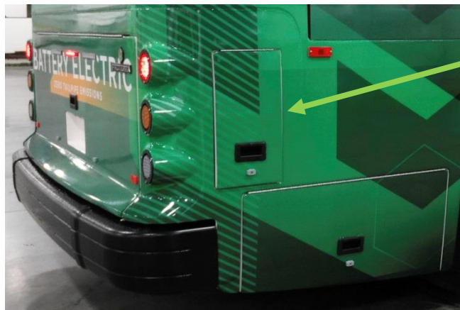
Curbside Rear Access Panel