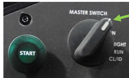
Master Switch (OFF Position shown)